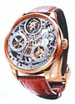
Portuguese Tourbillon in rose gold by IWC HK$1.07 million