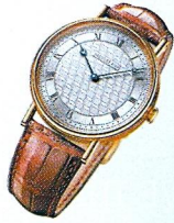
Art Deco by Breguet HK$136,600