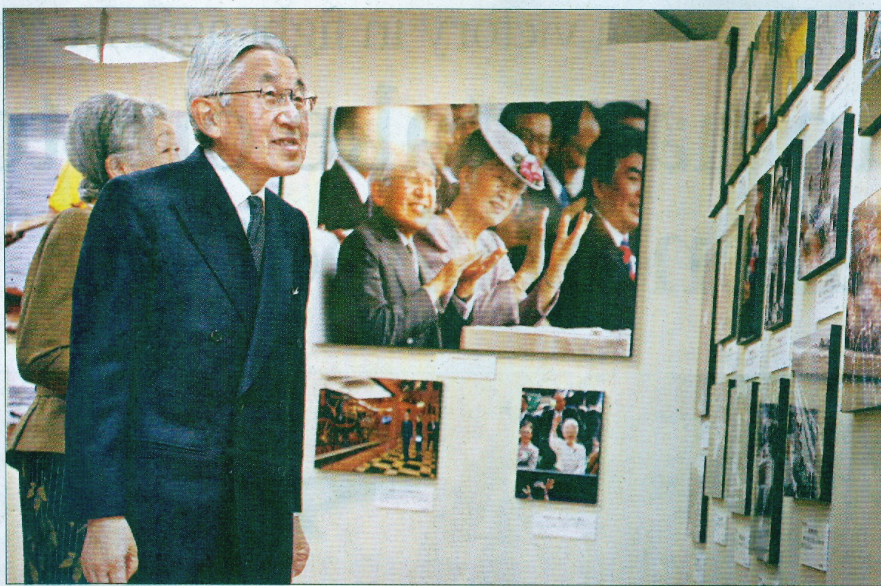
Majestic focus. Japanese Emperor Akihito and Empress Michiko look at photographs of themselves at a press exhibition yesterday in Tokyo.

The Manhattan prosecutors, at a separate news conference, said Credit Suisse stripped out references to Iran from electronic messages directing payments. Credit Suisse sometimes substituted abbreviations or the phrase "one of our customers" for Iranian clients' names, they said. The changes were designed to slip the payments past filters US banks use to block Iran-related transactions. The bank is said to have used such tactics from the 1990s through to 2006, processing more than US$700 million in payments that violated US sanctions.