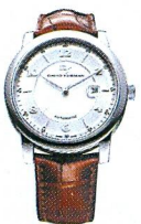
Classic Automatic by David Yurman HK$25,400