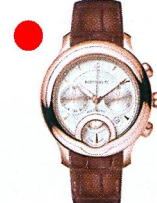
Giro by Bertolucci HK$179,000