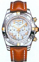
Chronomat by Breitling HK$70,700